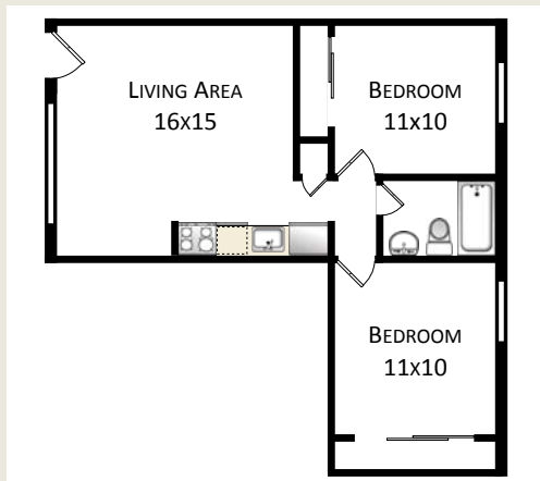
TWO BEDROOM, 645 SQFT

VIEW ALL AVAILABLE UNITS AT WWW.CORNERSTONEAPARTMENTS.COM