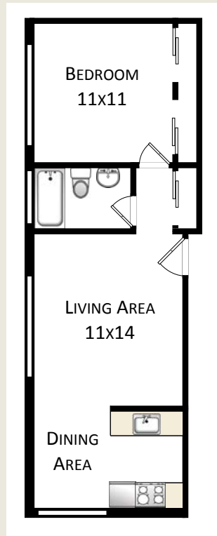
ONE BEDROOM 555 SQFT

VIEW ALL AVAILABLE UNITS AT WWW.CORNERSTONEAPARTMENTS.COM