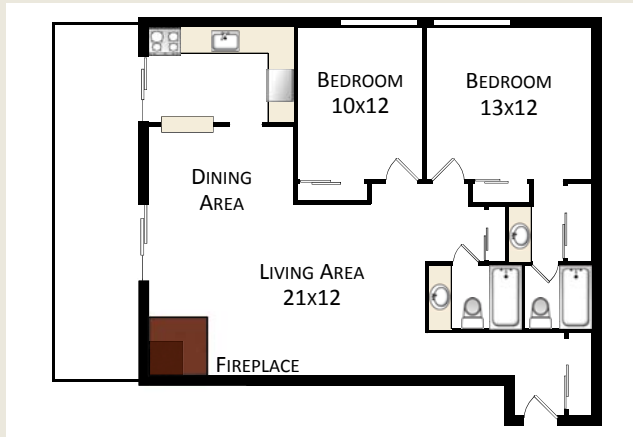
TWO BEDROOM, 1,040 SQFT + BALCONY

VIEW ALL AVAILABLE UNITS AT WWW.CORNERSTONEAPARTMENTS.COM